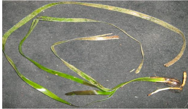
Fig 1. Seagrass Enhalus sp.

activity was defined by the formation of inhibition zones around the paper discs (Radjasa et al. , 2007).