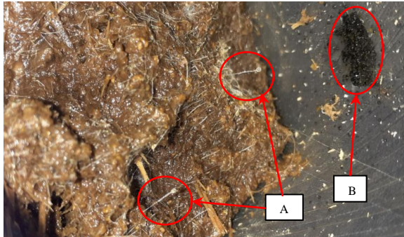
Figure 1. Growth of Pilobolus sp. on horse feces (A) Pilobolus sp.; (B) Spores of Pilobolus sp.

hartebeest, buffalo, giraffe, muntjac, and eland feces. In addition, the presence of coprophilous fungi can act as a monitoring tool for ecosystem changes. The level of diversity can indicate environmental stability; the higher the diversity, the more stable the environment, while low diversity indicates stress on the ecosystem.