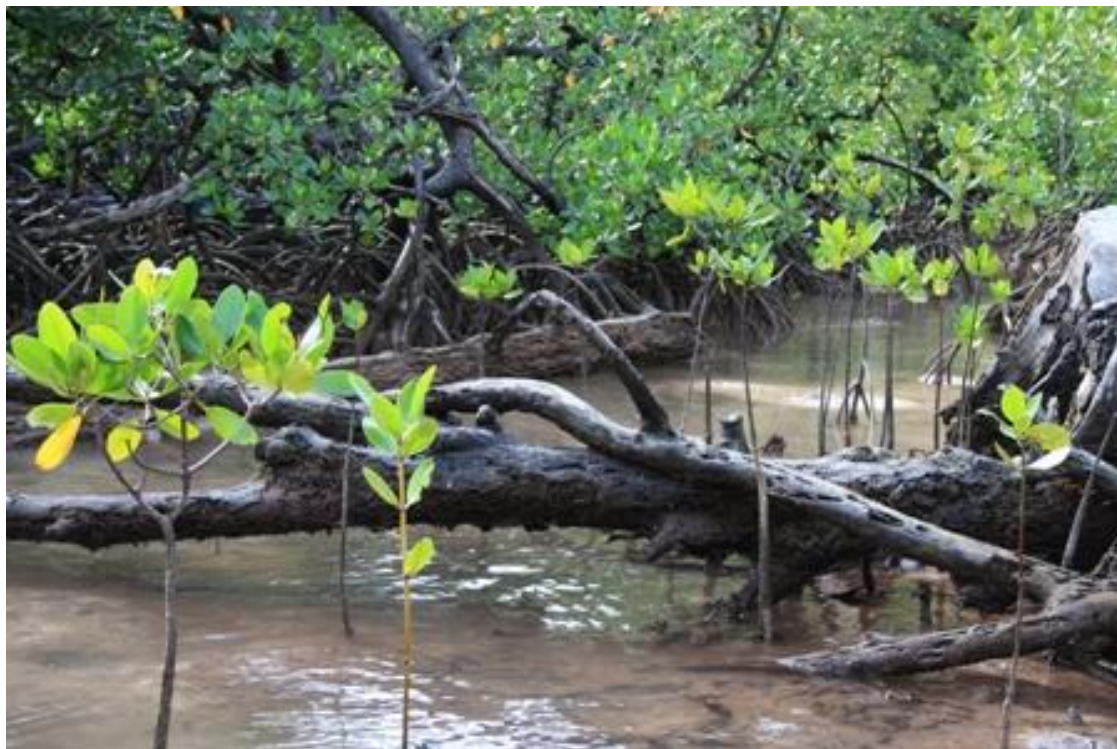
Fig. 1. Mangrove area that can be used for pond aquaculture.

the point of clear-felling for aquaculture, so, it cause an ecological changes in coastal areas and has consequences for people who living in coastal communities as they depend upon mangrove forests for a variety of benefits. For example, mangroves have provided many household necessities such as charcoal, construction materials, firewood, herbal plants for traditional medicines or ecological benefits such as acting as windbreaks, controlling shoreline sedimentation and providing a habitat for marine animals. Therefore, the destruction of coastal mangrove or marsh will lead to a general decline in wild stocks.