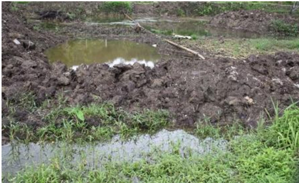
Fig. 3. Site selection for opening pond may cause destruction of coastal area.

The success of a commercial aquaculture business depends on providing the optimum environment for rapid growth. RAS offers the advantage over coastal pond aquaculture of being able to control the environment and water quality parameters to optimise fish health. Some parameters are crucial to RAS i.e., pH, temperature, suspended solids, and concentrations of nitrogenous compounds such as ammonia, nitrite, nitrate, dissolved oxygen (DO), carbon dioxide (CO 2 ) and alkalinity (Timmons, et al. , 2001). For instance, the optimum pH range for biofilter bacteria in RAS is around 7 to 8. The pH tends to decline as bacterial nitrification produces acids and consumes alkalinity and as CO 2 is generated by microorganisms and cultured animals. Water reacts with CO 2 to form carbonic acid that resulted to the decreasing of pH value, so, nitrifying bacteria will not be able to remove wastes of toxic nitrogen. Therefore, adding alkaline buffers is needed to maintain the optimum pH range. Moreover, continuously supplying adequate amounts of DO is essential as nitrifying bacteria become inefficient at DO concentration below 2 ppm. Generally, DO have to be maintained above 5 ppm for optimum cultured animals growth (Losordo, 1998).