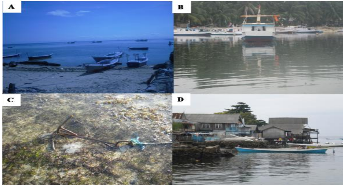
Fig. 2. Common boating activities in Indonesia. (A,B) Parking boats in seagrass beds, (C) anchoring in the seagrass beds as a part of boat parking, (D) boats as the only transportation facility for the local coastal communities.

2004). The seagrass can make self-recovery and regrow in propeller scars, however it takes time and species dependent (Dawes et al. , 1997).