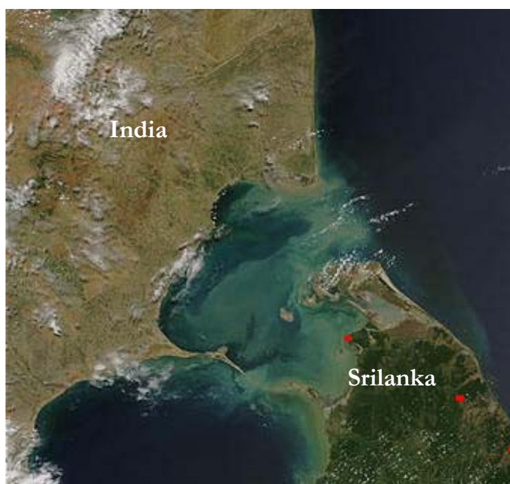
Fig 1. Map of Palk Strait – Sedhusamudram Project Area