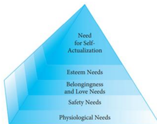
Graphic 1. Maslow's hierarchy of needs (Burger, 2011, p.286)

Furthermore, any self-protection mechanism can be a permanent part of the personality that assumes the characteristics of a drive or need to determine an individual's behavior (Schultz, 2016, p. 141). In other words, the fulfillment of human needs becomes part of a personality that can determine a person's behavior. Further, Maslow (as cited in Schultz, 2016, p. 250), there are five basic needs that composed of physiological needs, safety needs, belongingness and love needs, esteem needs, and self-actualization needs which are active and direct human behavior. Maslow also explained that such needs are arranged in order from the strongest below to the weakest at the top and lower needs must at least be partially satisfied before higher needs become influential. For instance, hungry individuals have little desire to satiate their greater need for esteem (Schultz,2016, p. 250).