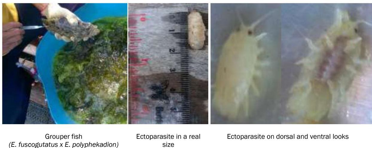
Figure 2. The grouper fish and its ectoparasite

The sampled groupers indicate that there was 43.3% of the fish (Checking I). It means that there are 43 groupers was attacked by the ectoparasites in 100 individuals of the population. This prevalence of ectoparasite is harmly impacted for the fish culture which becomes one of the fish death sources. It was depicted during five months of rearing. There were 280 grouper seedlings death with wounds on skin and gills as well as the injured fish were difficult to eat. Further, the prevalence decreased in the next checking period (Checking II) which was only 8.8% that was probably due to the three prior months, those fish had been cleaned