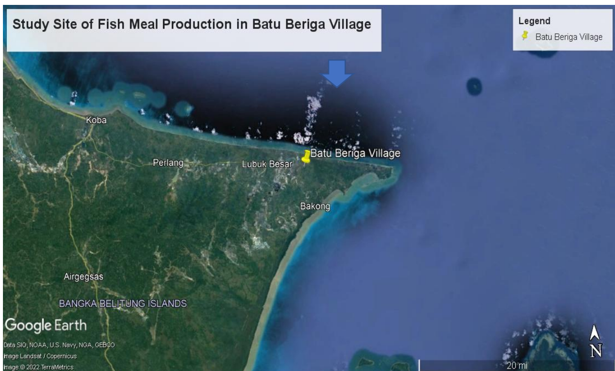
Figure 1. Research Location in Batu Beriga Village, Central Bangka Regency

The result of fish identification showed that the bycatch consists of goldstripe sardinella ( Sardinella gibbose ), yellowstripe scad ( Selaroides leptolepis ), and butterfly whiptail ( Pentapodus setosus ). From 4 kg of fresh bycatch fish sample could only be produced as much as 0.4 kg of fish meal (10%). The nutritional content of fish meal was shown in Table 1 and Figure 2.