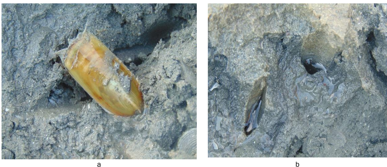
Figure 3. The position of the lingulid clam during sampling (in the substrate, i.e. the pedicle is at the bottom and the shell is at the top (habitat); and (b) the hole in the lingulid clam habitat.