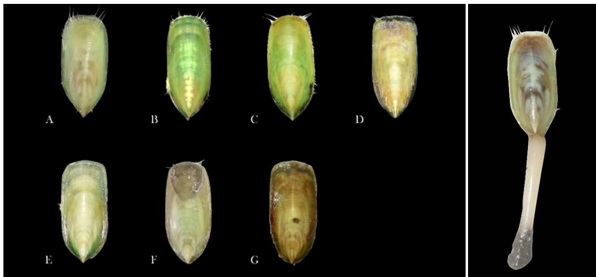
Figure 2. Morphology of lingulid shells found in all research locations. A: Bangkalan Regency; B: Pamekasan Regency; C: Sumenep Regency; D: City of Surabaya; E: Pasuruan Regency; F: Probolinggo Regency; and G: Situbondo Regency; scale bar 30mm.