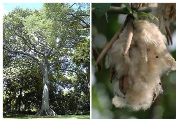
Fig. 1 Morphology of ceiba petandra

Borges et al. (2012) had reviewed recent developments in heterogenous catalysts for biodiesel production Ong et al. (2013) conducted his research to an optimization of catalyst-free biodiesel production from Ceiba petandra oil (Ong et al. 2013). To the best of author's knowledge, there is limited study on naturally alkaline catalyst for biodiesel production from Ceiba petandra oil. By utilizing naturally potassium hydroxide catalyst from Ceiba petandra peel, it is expected to support green energy programme. The aim of this paper is to investigate biodiesel production from ceiba petandra seed oil using naturally potassium hydroxide catalyst.