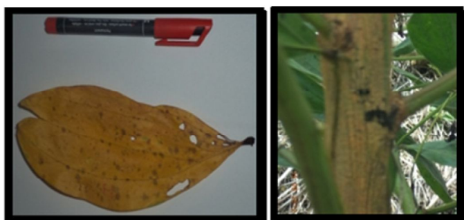
Fig. 1 Phyllode and stem of mangium infected by Meliola brisbanensis

Black spot disease or black mildew disease was a disease with symptoms of black spots on phyllodes which more occurred on the upper surface than the lower. Other than phyllode, the young stem of the tree was also attacked. Infected phyllode changed in color from green to yellow (chlorotic). Symptoms of such diseases caused by fungi Meliola brisbanensis (family Meliolaceae, orders Meliolales). Symptoms of fungal attack by M. brisbanensis presented in Figure 1.