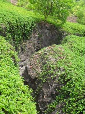
Figure 2. Soil erosion at post coal mining site in Kutai Kartanegara district

A soil condition with low fertility level was caused by the mixing of all soil layers from top to the bottom layer. Separation process of top soil carried out by coal companies was not the actual top layer ( A_0 atau A_1 layer). A process of removing soil using bulldozer was not able to push or remove A<sub>0</sub> atau A<sub>1</sub> layer which located at 0–10 cm depth. The capability of bulldozer is to remove soil layer at 2-50 cm depth. However, top soil at ultisol soil in East Kalimantan is 5–10 cm depth which generally occurs in