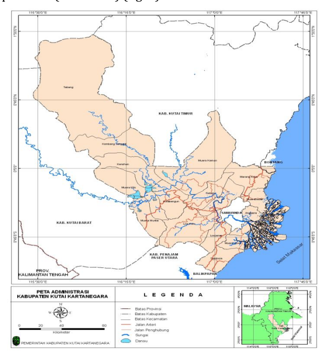
Figure 1. Research location in Kutai Kartanegara district.