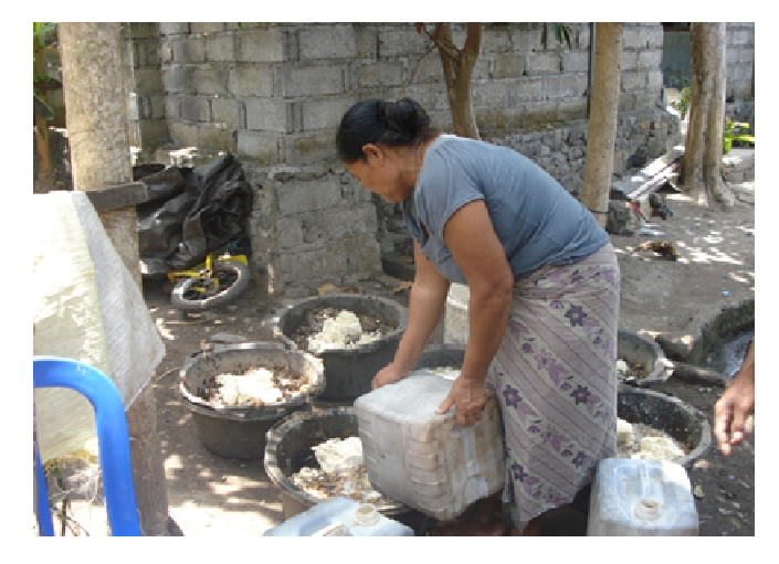
Figure 3.Farmer preparing feed for their goats (banana trunk, waste tofu cake, tick leaf, sweet potato leaf).

In general, the body color of Gembrong goats is white, or partly brown, and solid brown. The average body weight is 23.2 kg for females and 30.7 kg in males, with body length of 60 cm, height 58.2 cm, and 14.4 cm ear length in males, andin females body length is 56.2 cm, height 55.1 cm and 14.2cm ear length, and other body measurements is presented in Table 2.Mahmalia et al. (2004) reported that the body shape of Gembrong goat was smaller than Ettawa grade, but bigger than Kacang goats.