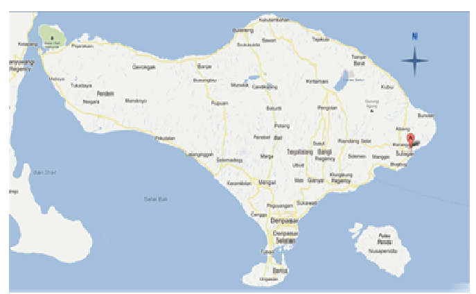
Figure 1. Location of Gembrong goats at Tumbu, Karangasem, Bali Indonesia

Study was done in Dusun Ujung Hyang, Tumbu Village at Karangasem District of Bali Province in Indonesia (Figure 1). The location is situated around 8°27'07.42" S and 115°37'33.53" E, with elevation of 229 ft. above sea level. The temperature ranges between 23°-27° C with humidity around 69%.