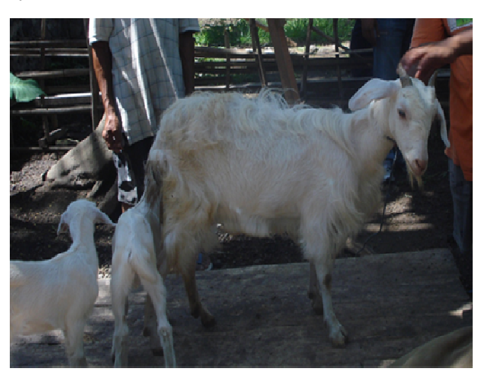
Figure 5. Female Gembrong goats with twin kids Multiplication of existing Gembronggoats population

To preserve Gembrong goat population from extinction, there are three collaborative activities needed, namely: (1) multiplication of existing Gembrong goat population, (2) Rescuing animal genetic material and (3) up-grading female Kacang goat with Gembrong male goat as to achieve 99% Gembrong blood composition. This can be achieved on F<sub>7</sub> or after about 10.5 years to come (Table 3).