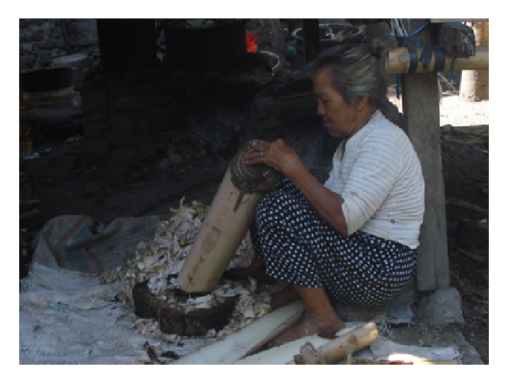
Figure 2. Feed preparation (banana trunk).

Mixture of forage/grass/legume were fed to these goats as well as feed supplement which consists of rice bran, waste tofu cake, banana trunk, teak leaf, and sweet potatoes leaf. Diseases that often attack are bloat, scabies and hernia. This problem has been traditionally handled by farmer, no assistance from veterinarian because there is no money to pay neither for medicine nor for vaccine.