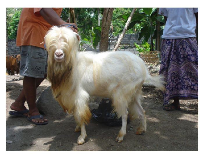
Figure 4. Male Gembrong goats

*n=9 heads; **n=6 heads *** (Setiadi et al. 1998)