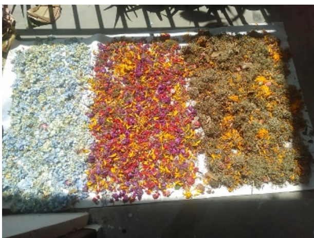
Figure 3 The discarded flowers are separated and dried up