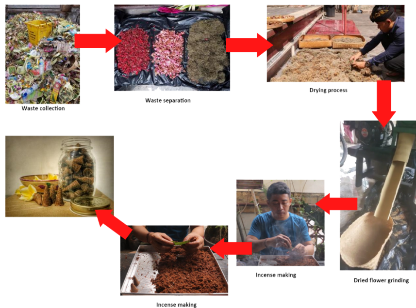
Figure 4 The Organic Incense Making Process