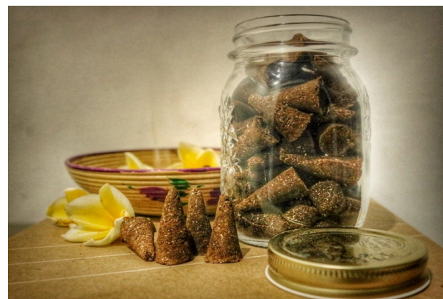
Figure 4 The prototype of organic incense from discarded flowers

Note: * (poor), ** (good), *** (very good)