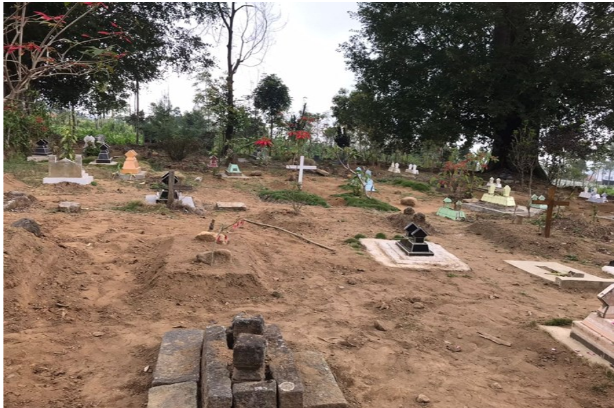
Figure 2. Public Cemetery in Buntu Village

Table 1 illustrates the condition of heterogeneity of religious beliefs held by Buntu Village's community. The village contrasts itself with other typical villages in Java which generally hold homogeneity of beliefs. Tolerance is the keyword to live side by side, peaceful, and harmonious as one village entity. Furthermore, the manifestation of tolerance can be clearly observed in their practice of funerals. The Buntu Village's cemetery welcomed any person without differentiating of religious identity. There is no grouping based on people's beliefs in that cemetery in Figure 2.