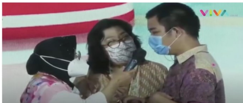
Picture 1. Deaf Disability Dialogue

Source: https://www.youtube.com/watch?v=pYAx8JNyc0