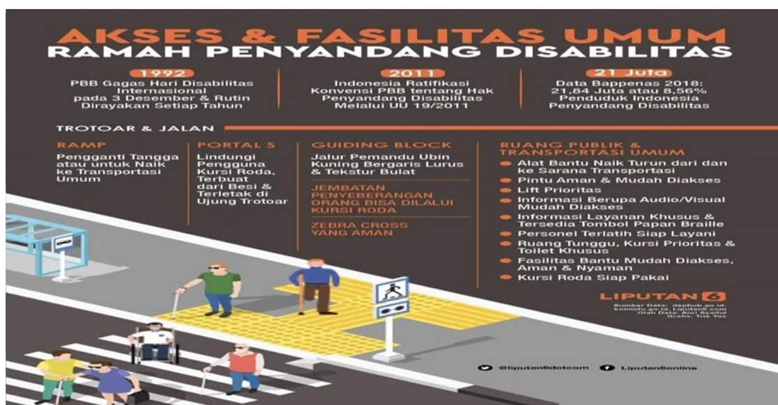
Figure 4. Disabled Friendly Public Facilities