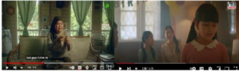
Figure 3. Comparison of Maxis and Indosat Ooredoo Ads towards Uncertainty Avoidance