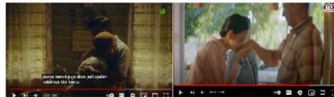
Figure 2. Comparison of Maxis and Indosat Ooredoo Ads towards Power Distance

term adaptation. Conversely, Indonesian culture values long-term orientation judging by Indosat Ooredoo's advertisement. Social connectivity requires a lot of time investment and maintaining family connection felt to be a requirement to Indonesian community.