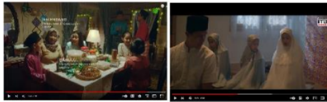
Figure 4. Comparison of Maxis vs Indosat Ooredoo Ads in Describing Togetherness.

Uncertainty Avoidance is strongly related to tolerance for ambiguity (Gallego-Álvarez & Pucheta-Martínez, 2021). An ambiguous situation can be threatening and uncomfortable to some, which is rules are being ordered in order to reduce the uncertainty. Both advertisement, Maxis and Indosat Ooredoo display strong uncertainty avoidance, Figure 3 demonstrate both advertisements as having strong uncertainty avoidance because they wanted clarity and structure when the situation is ambiguous to them. For Maxis, there are a few scenes when the wife insisted on wanting to know what the husband is doing behind her, which prompts her ambiguity. Similarly, for Indosat Ooredoo, the younger daughter in the advertisement, showed her dissatisfaction over a discussion and left, then, the mother called her to comfort her. These two scenarios display higher stress and deeper emotions which is very much related to having strong uncertainty avoidance.