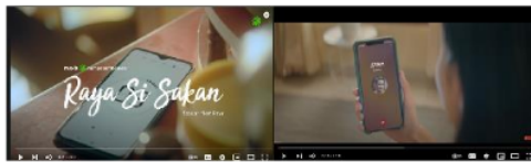
Figure 1. Comparison of Maxis and Indosat Ooredoo Ads towards Digital Culture

Indosat Ooredoo's advertisement, in contrast, displays how technology can be used as a means to further improve a relationship. The cultural perspective is shown at the beginning of the advertisement where an actress is shown holding her cellphone with a call display. Furthermore, the one on call is the "Father" figure of the actress which improves how connectivity can be maintained despite the pandemic (Bergman et al., 2020).