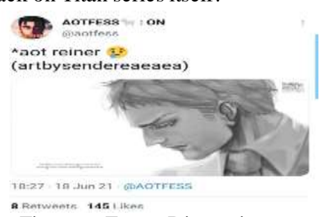
Figure 6. Fanart Discussion

5. The fifth is discussion content, which is content that contains questions about opinions addressed to fans or followers who follow the AOTFESS account regarding storylines or other things that are still related to Attack on Titan, whether about anime series, manga, voice actors or seiyuu, and other things. However, according to the author's observation as a researcher, things that are often discussed or asked in discussion content like this are things related to the storyline and theories that exist in the Attack on Titan series itself.