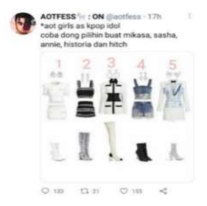
Figure 1. Alternate Universe (AU) Content

The type of content described by the author and researcher is content that was observed from May 20, 2021 to June 21, 2021. The following is a description and analysis of the types of content obtained from observing the AOTFESS account.