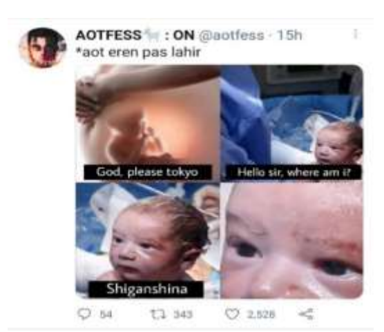
Figure 3. Meme Content

2. The second is the content of hallucinations or hallucinations that are just for fun or entertainment. Fans can imagine scenarios where one or more specific characters have roles as their best friends, parents, or even lovers. For example, fans usually send a fake chat image or a conversation text that is edited by them, then adjust the content of the existing chat according to the nature or characteristics of the character they want to create.