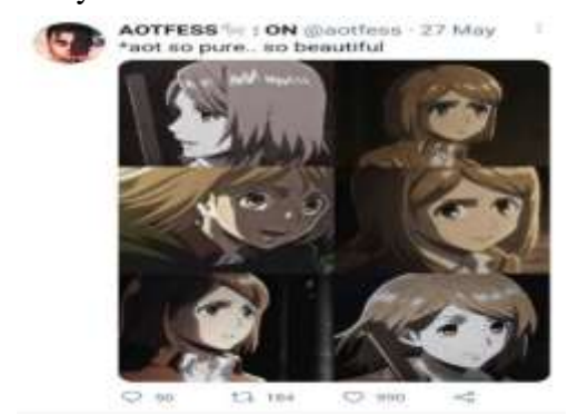
Figure 4. Appreciation Tweet Content

creativity by channeling it through this funny content or meme.