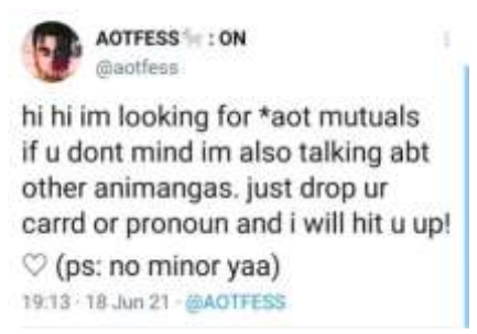
Figure 7. Finding Mutual Content

who like series other than Attack on Titan or multifandom (following various types of film or music series), and likes the pairing or pairing of characters A and B from Attack on Titan.