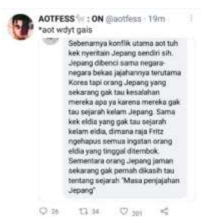
Figure 5. Storyline Discussion Content

4. The fourth is content intended to appreciate a character or appreciation tweet. Appreciation tweets are content that is sent to the AOTFESS account by fans or fans to appreciate various aspects of a character that comes from Attack on Titan. This appreciation varies, starting from praising the existing character designs, or praising their roles and behavior while in the storyline. Fans also create appreciative content which is often referred to as glowup content. Glow up content on the AOTFESS account is content that compares a photo of a character when he was young or very young with a photo of the character when he was an adult and underwent a significant facial change and became more fashionable.