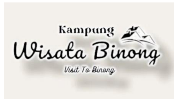
Figure 2. Binong Jati Creative Tourism Urban Village Logo

Most responders also concurred that Binong Jati creative tourism urban village's new logo and slogan effectively convey the desired new qualities and image. The test results, however, show that even though it was executed, more than the redesign process in the rebranding attempt was needed to drastically alter the brand image of Binong Jati creative tourism urban village, which was connected with knitting and its derivatives.