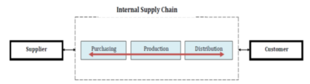
Figure 1. Typical Supply Chain, Tian (2009)