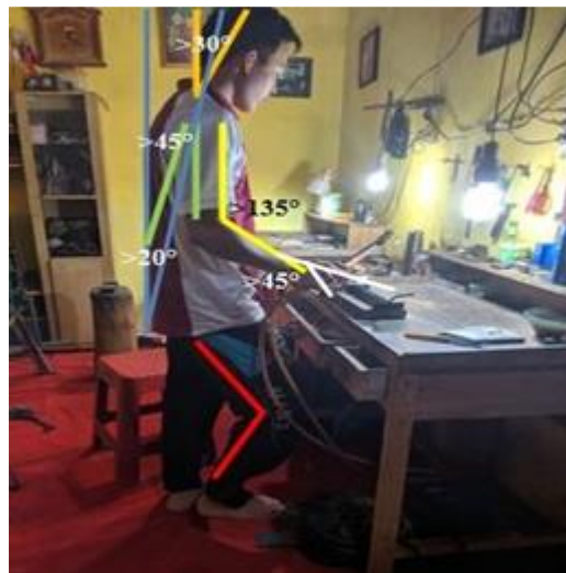
Figure 1. Smelting Work Posture and Ergonomic Measurement Angle

interview guidelines (modified from Nanda research, 2019), BRIEF survey sheet, and Nordic Body Map questionnaire (Inc, 1995). Sample determination techniques are done purposive random sampling. The source of information is 2 people as a key informant and 5 people as informants. The level of ergonomic hazards in 9 parts of the worker's body is determined based on the BRIEF method