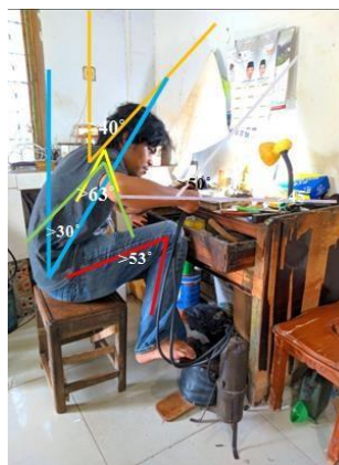
Figure 4. Working Posture of Jewelry Formation and Ergonomic Measurement Angle

Behind Body is 15 seconds long with a frequency of 4 times per minute including a high level of ergonomic hazard. Malaysia has a lot of work that requires the shoulders to bend next to the body and arms behind the body which is done continuously resulting in 53% of workers experiencing shoulder pain (Zein et al., 2015). The position of the neck flexion 45^\circ duration of 30 seconds with a frequency of 2 times in 1-minute causes complaints of pain in the neck. Bent posture causes neck flexion then to risk of having MSDs. The 40^\circ flexible back position of 30 seconds for 2 times per minute is included in the high ergonomic level. According to Pheasant and Haslegrave theory estimates that approximately 30% of skeletal muscle injuries, especially the waist and back, are caused by bending work attitudes. Grinding work posture can be seen in Figure 2 .