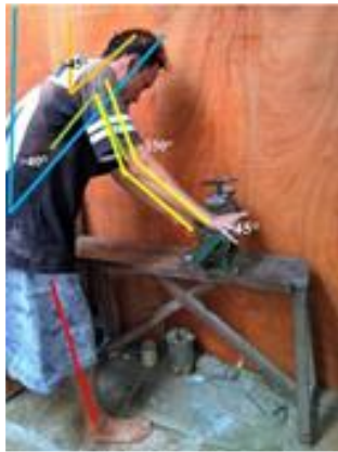
Figure 2. Polishing Working Posture and Ergonomic Measurement Angle