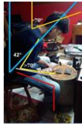
Figure 3. Ergonomic Posturing and Measuring Angle