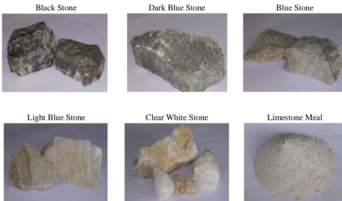
Figure 1. Composites of Bukit Kamangs' Limestone in Different Colors and Limestone in Meal Form

larger size in meal product. This component seemed to have higher degree of hardness than the other colors, so that they were more resistant by milling process. According to Farmer et al. (1986), limestone meal with larger particle size would stay in longer period in the acidic environment of the gizzard which leads to provide more available ionic calcium ( \text{Ca}^{2+} ) in the small intestine during the night-time for eggshell calcification. Moreover, the larger particle have a function as grit, which help digesting process of feed in the gizzard, so that it gave positive effect on nutrient metabolism for poultry (Scholtyssek, 1987).