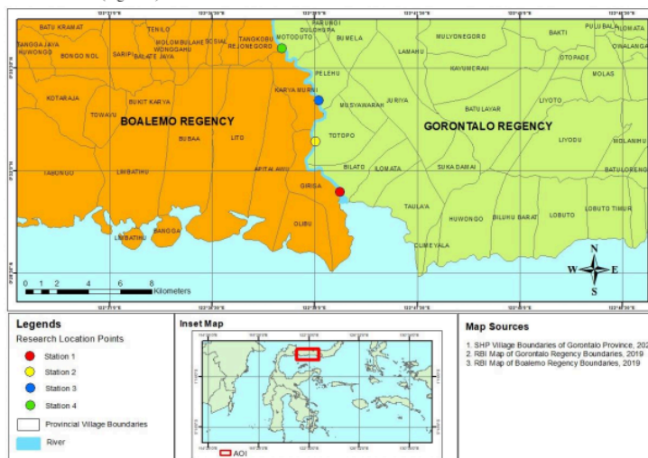
Figure 1. Sampling locations in the Downstream area of Paguyaman River, Gorontalo

This study was carried out in the downstream area of the Paguyaman River in Gorontalo from June to July 2024. Four sampling stations start from downstream right at the mouth of the river, such as Station 1 (N 00°31'16.6"; E 122°38'52.00"), followed by station 2 (N 00°33'00.7"; E 122°38'02.50"), station 3 (N 00°33'59.1"; E 122°38'20.50"), and station 4 (N 00°36'11.0"; E 122°36'52.20"), with a distance of 3-4 km between stations (Figure 1).