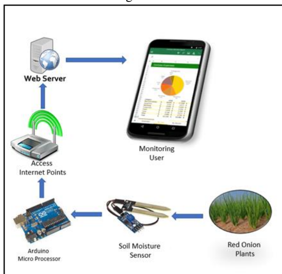
Fig. 1. Flow data acquisition

processed into time series data stored on the local database on the microprocessor by using internet network historical soil moisture data sent to the web server and stored online the database is then predicted which can be seen in Fig 1.