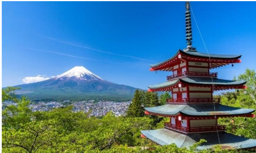
Figure 1 Description of what is contained in the first panel