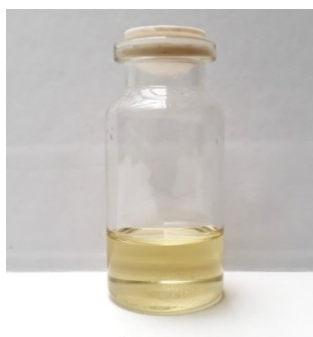
Figure 1. Peacock flower ( C. pulcherrima ) leaf essential oil

The density of peacock flower ( C. pulcherrima ) essential oil obtained is 0.9320 g/mL. This result is supported by the finding of Nugraheni et al. [9], which states that the density of essential oils at 25°C is between 0.696-1.188 g/mL. The product of the distillation of peacock flower ( C. pulcherrima ) leaf essential oil can be seen in Figure 1 .