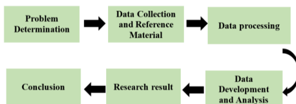
Figure 1. Research Flow

Figure 1 shows that the analysis process consists of four stages: data collection, selection and coding, data analysis, and display and reporting of results (Bengtsson, 2016). In the first stage, the researchers collected the data that had been implemented by all companies in the education and health sectors from 2019 to May 2023