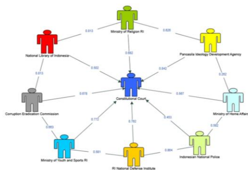
Figure 3. Actor Collaboration