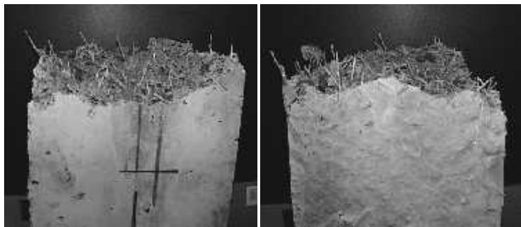
Figure 3. Split-failed specimen

was predicted, the crack propagated fast caused final failure on the specimen. While, on the beam with 2% of PVA fibers, after first cracking, the beam did not lost its strength but the specimen was still going to bend. The maximum load was about 24 kN. On the specimens of type I with 1% of PVA fibers, after first cracking, the loading capacity was going down. However, due to the effect of the bridging of the PVA fibers on the cracking, the beams did not lost its strength suddenly as on the specimens without PVA fibers but it decreased slowly. The PVA fibers on the cracking section prevented the cracks to propagate fast. Based on the beam specimen results, it could be concluded that the strain hardening condition occur in type II for V_f=2\% which is indicated by the increasing of loading capacity after first cracking. The strain hardening occurs only if there are certain fiber volume fractions that can act as the bridge to prevent the propagation of cracks after first cracking. Figure-3 shows the split-failed specimen at the cracked section. It can be observed that most of PVA fibers on the cracked section were pulled out.