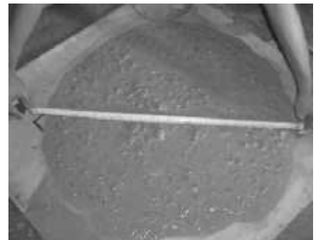
(b). Measuring slump flow