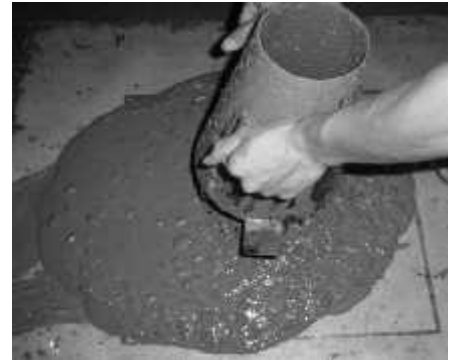
(a). Removal of Abrams' cone

compressive strength of SCC at 7 and 28 days are shown in Figure 3. Like another Portland cement, the strength of Portland Pozzolan cement develops with hydration time.