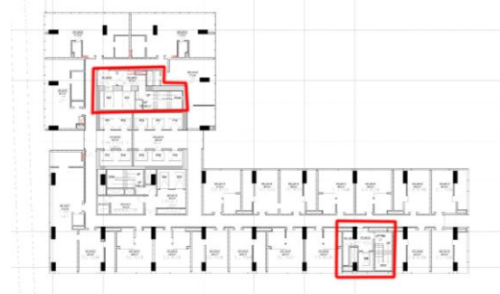
Figure 1. Plan of 18 th floor Building X

Both of the apartments were highrise kind of buildings, so the fire protection system as life technical facilities are a must prepared and ready to use devices.