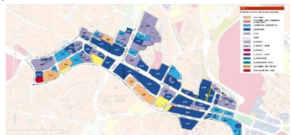
Figure 2 . Orchard road building blocks