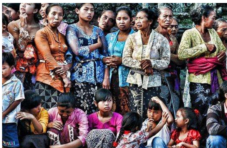
Fig. 1. Description of what is contained in the first panel