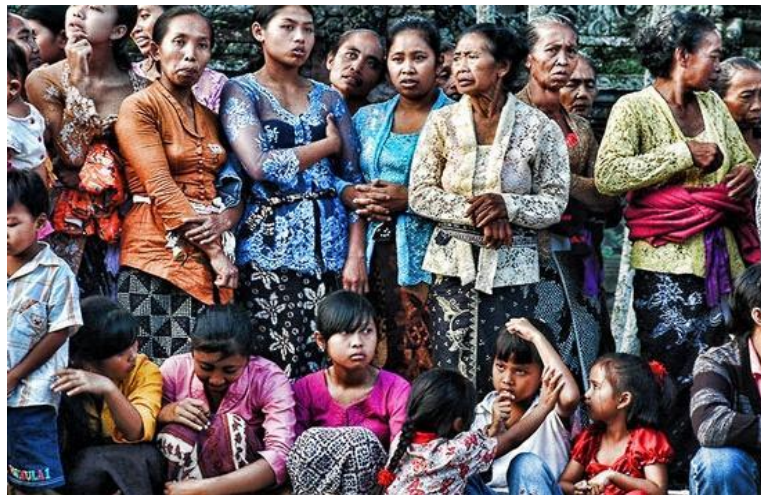
Fig. 1. Description of what is contained in the first panel