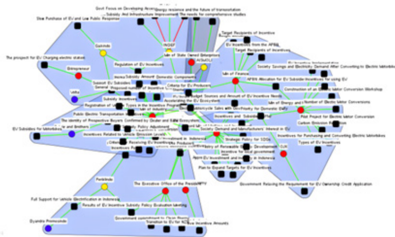
Figure 3. Affiliation Network (Organization-Concept) Visualization

The affiliation network visualizes the interconnectedness between organizations and concepts, as demonstrated by Leifeld and Haunss (2012). This part will be focused on the Network Organization-Concept, as shown in the figure below. Therefore, the nodes that appear in this section are differentiated into three nodes; Government (Red), Civil Society Organization (Yellow), and Corporate/Private Company (Blue).